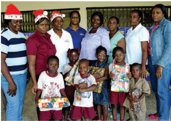
Some members of staff from JPS and St. Wade's Basic School, take time to pose with a few of the children at the Christmas treat.