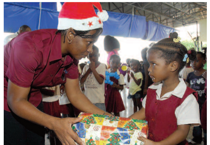
Okay, let's keep that eye contact going...