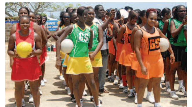
A section of the dress parade

Following the ceremony, it was team parade and rally time, with each team playing 10-minute games for parish rally honours. Rally winners were Starlights B for St. James, Trelawny Starlights named after their parish, Russia for Hanover and Westlanders for Westmoreland.