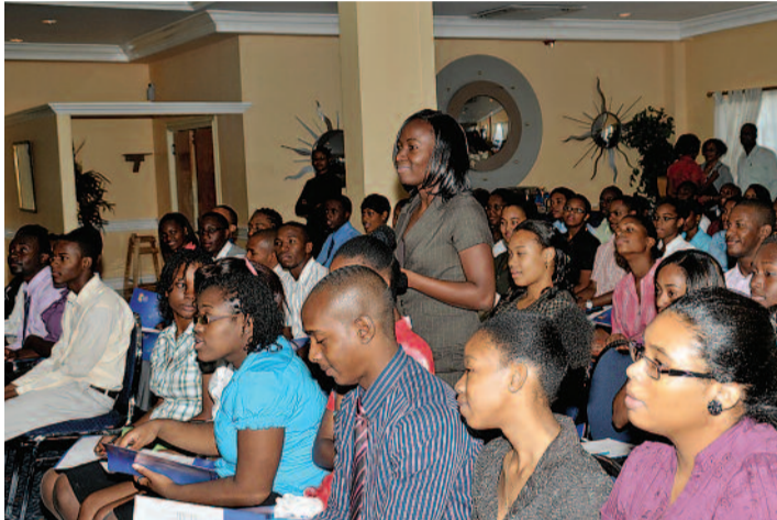
A Summer Employee asks a question during the launch of the Company's 2010 Summer Employment Programme.

The summer employees, who range from high school to the post-graduate level, have been placed in JPS locations across the island as well as at a number of partner agencies including: Bustamante Children's Hospital, CHEST Hospital,